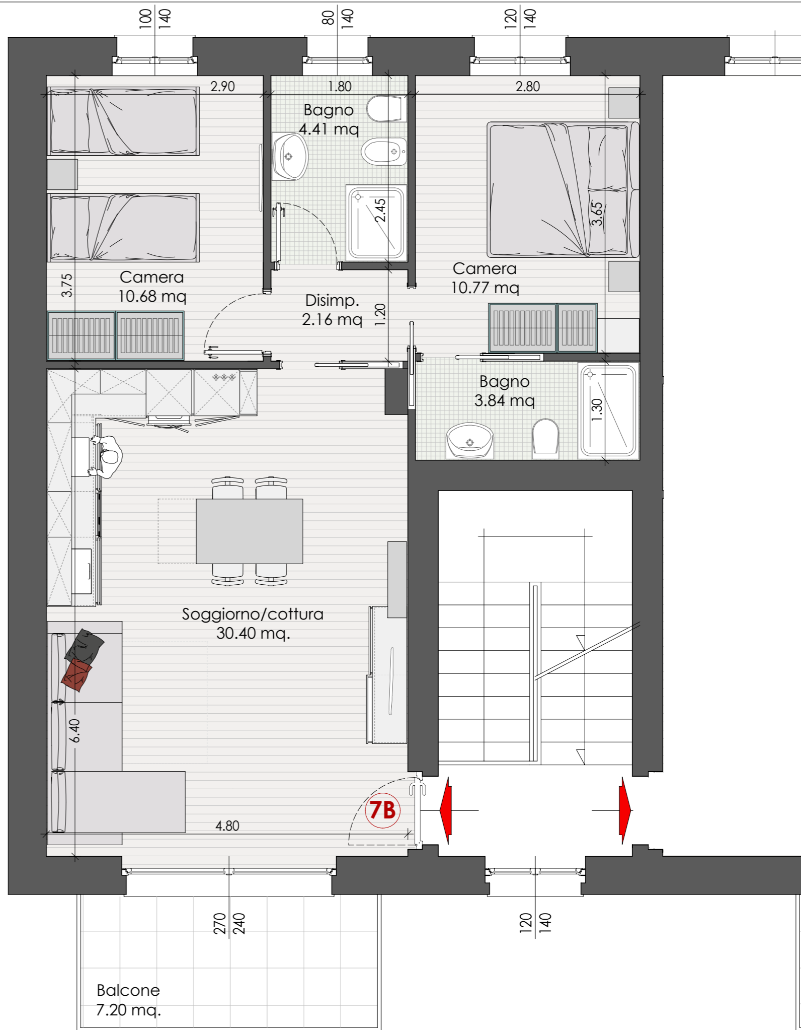
scala 1:50 APPARTAMENTO 7B - piano primo